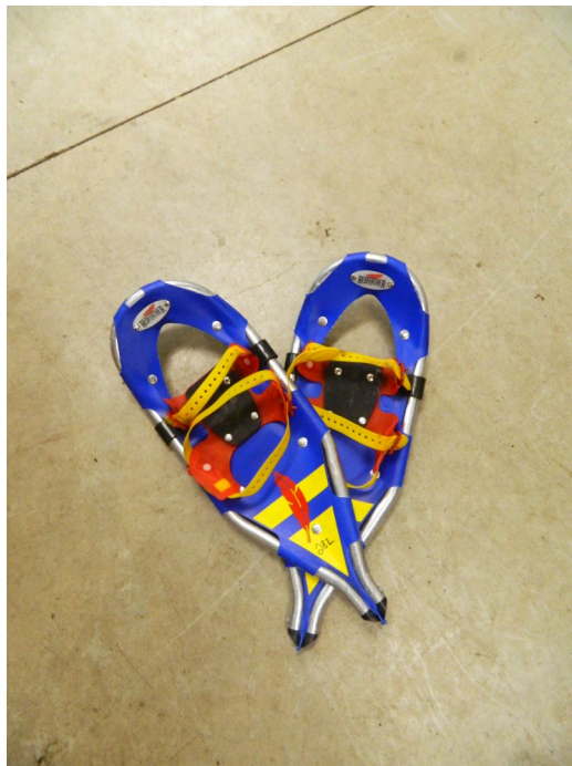
Redfeather 20", supports weights up to 90#.