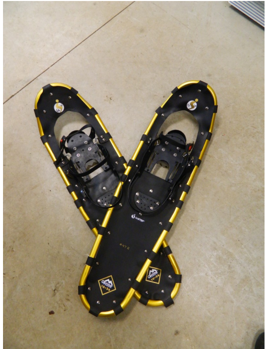
Optima Instep 36", supports weights up to 300#.